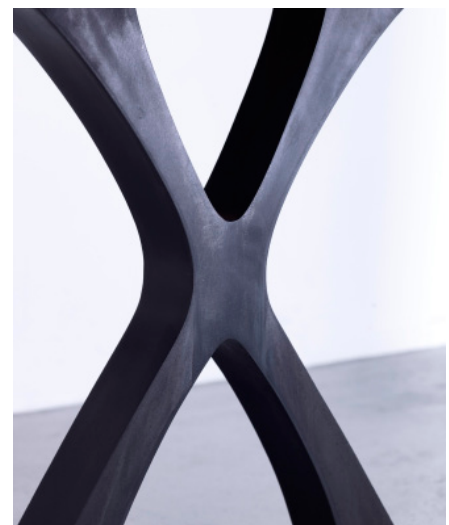
The Exe dining table, 170 x 90cm, Steel with a black patination, bookmatched Elm with wane edge, oiled and waxed. RRP: £13,116

For image requests or press loans please contact Nicola Evans at nicola@tomfaulkner.co.uk or call +44 (0) 20 7351 7272